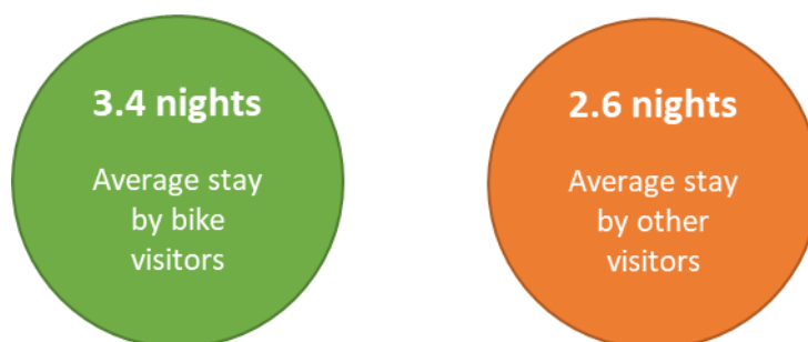
Figure 1 – Average stay length by bike visitors compared to other visitors

Applying an average stay of 3.4 nights to the estimated 176,634 visitors who bike suggests that these bikers spent a cumulative 600,557 nights in Queenstown-Lakes District in the June 2021 year.