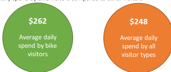
Figure 2 – Average daily spend by bike visitors compared to other visitors

Combining these daily spend estimates with the guest night figures above suggest that spending in Queenstown-Lakes by visitors who bike totalled $157.6 million in the June 2021 year.